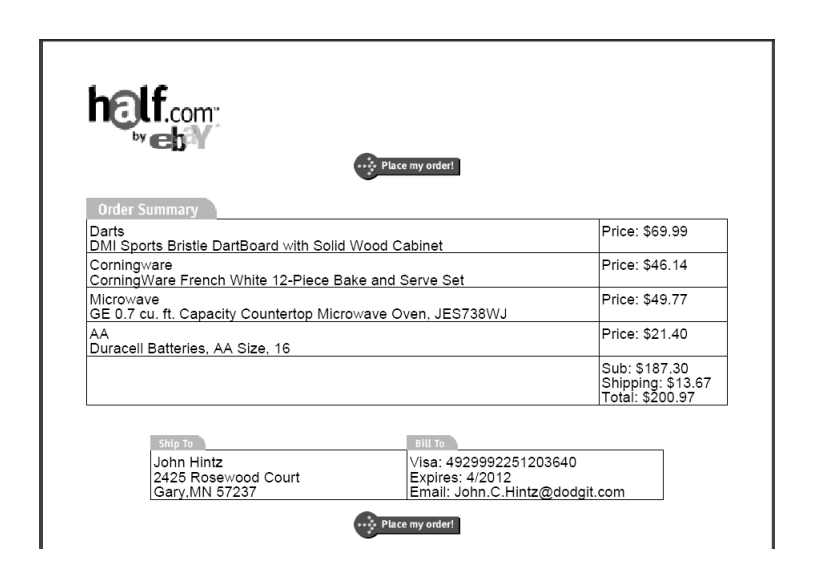
Fig. 3. Decoy eBay receipt.